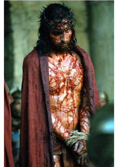
“Here is your King.” —Pontius Pilate

Yes, here He was, the very hands that healed, “blasphemously,” on the Sabbath. The hands that touched many lives, the feet that traveled to many places spreading the grace of God, were now viciously nailed to the cross. A despicable act, and a barbarian way to die. Utter humiliation. Cicero, a Roman philosopher who died about 45 years before Jesus was born, called it a “most cruel and disgusting punishment,” and also said that there is “no fitting word that can possibly describe so horrible a deed.” He was speaking specifically in context of the “far be it from us” attitude that a Roman citizen ever even be mentioned in the same breath as crucifixion. No, this form of execution was only for the lowly, the dirty, the defamed, the unholy, the scum, the worst of the worst. This would be the sickening form in which the image bearers of God would kill their Maker, the very Maker who fearfully and wonderfully made them.