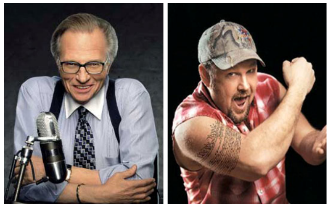
Pick a Larry.

Larry has it right, and seems to understand the importance and necessity of the doctrine of the incarnation more than Bell. Now, to be fair, Bell doesn't actually deny the virgin birth, but by his hypothetical questioning he absolutely denies its importance as a necessary doctrine of our faith. This question radically puts the doctrine of salvation in quite a trivial place. How can Jesus possibly be God if He was indeed born by two sinful parents? He could not. However, Larry King, as someone who was raised Jewish (but was a professed agnostic), understands that if Christ was "indeed virgin-born," it means that Christ really is the Messiah, and that, would therefore indeed define history.