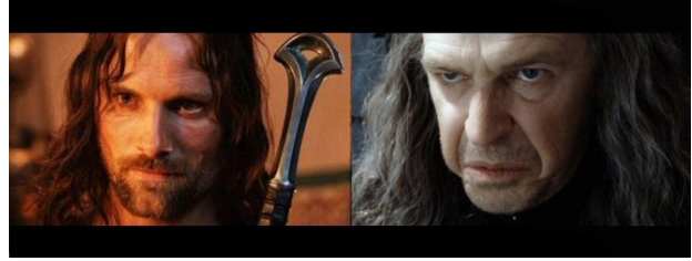
Gondor awaits their true King, but the Stewards are reluctant.

I liken this to the last of the three Lord of the Rings stories, the Return of the King . The Steward of Gondor was a legacy of men who were “keepers” of Gondor in the absence of the true King who would come from the line of Isildor. They were to humbly govern Gondor until the throne be truly inhabited by the true King. However, as the story unfolds, we see that Denethor, the current Steward of Gondor is not interested in handing over his power, especially to a lowly, common ranger (Aragorn, Isildor’s heir).