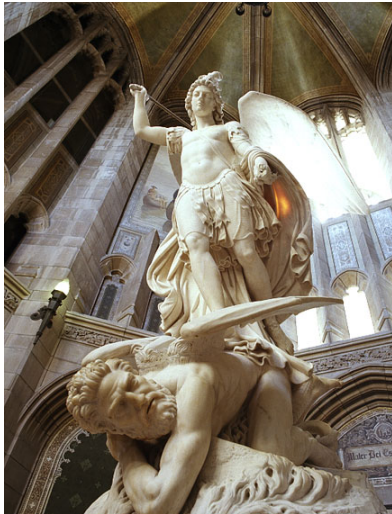
Arch-Angel Michael Deposing Lucifer

Satan is quite an enigmatic creature. There is much we know about him, and there is much we don't know about him. Throughout history and in our own lives, he can at times be given far too much credit and power in our own lives and minds, and yet other times we can also overly-minimize his role in this world (such as quoted in the movie the Usual Suspects , where the character Verbal Kent says "the greatest trick the devil ever pulled was convincing the world he didn't exist." Too true of a statement!).