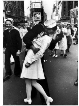
V-Day in Time Square, 1945

Indeed, Satan has been dealt a death blow, and he has a mortal wound, 366 but he will fight to the end, seeking to deceive and take as many as he could with him. Some have compared it to the difference in World War II between D-Day and V-Day. On D-Day, the Allied Forces dealt a crushing blow that would prove to be a permanent wound to the Nazi Regime. However, it wouldn't be until V-Day, eleven months later, when the Nazis finally, and in totality, were conquered by the Allies. 367